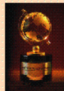
Tech Museum Award

Call : Sales: 99800 55566 Customer Care: 99800 77788 / 98800 88899